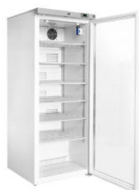
CMG300 Large Glass Door Refrigerator