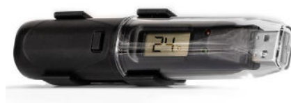
CMDL01 Advanced Data Logger with LCD Display