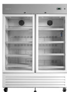
CMG500 Large Glass Door Refrigerator